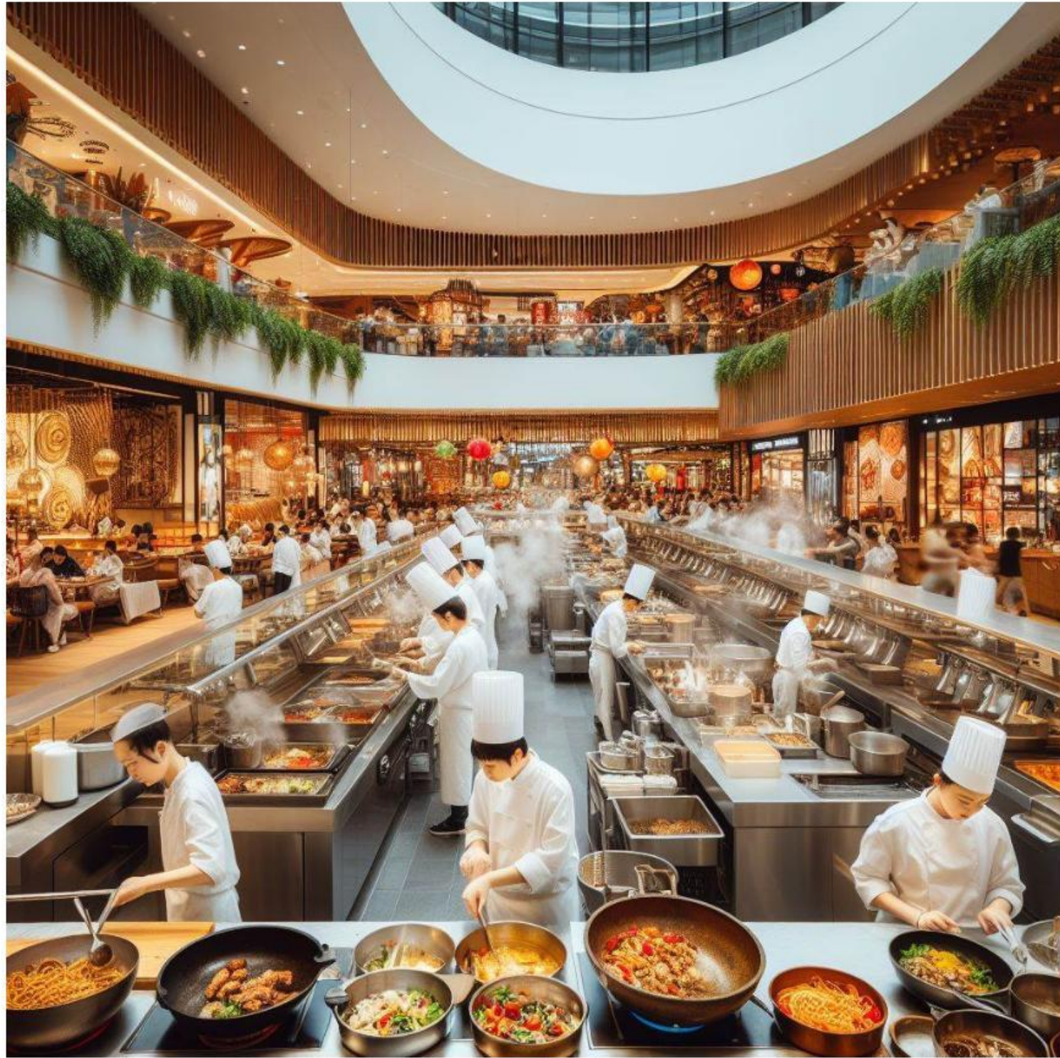
Food Mall Kitchens

RESTAURANTS, CAFÉS, HOTELS AND RESORTS CATERING FACILITIES, INSTITUTIONAL KITCHENS (SCHOOLS, HOSPITALS, INDUSTRIES)